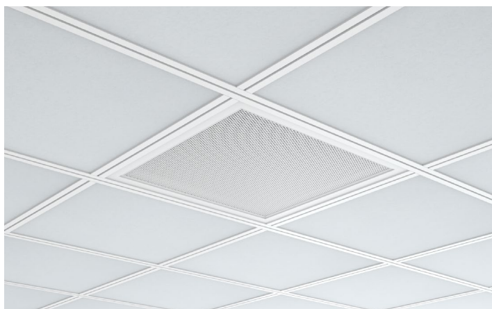
Perforated Air Device Price Model 10